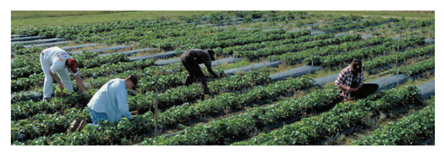
Page - 2

through the use of resources and judgement. They assign work and delegate the tasks at hand because the volume and range of work that has to be done are large. One person cannot do it all, and the mix of work to be performed in